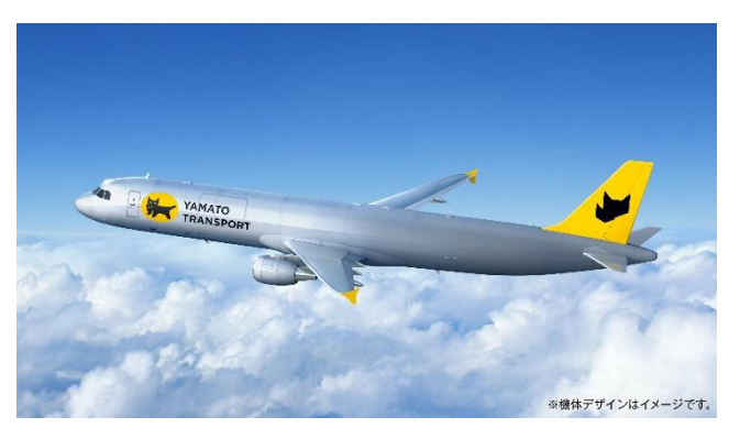
*Actual aircraft may differ from image.